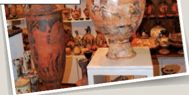
Snapshots of MK Interior Design projects reveal a brilliant master bathsuite fitted with class and delicate carvings. A sweeping yet subdued dining area with impressive columns is accented with dark fabrics and vintage vases.