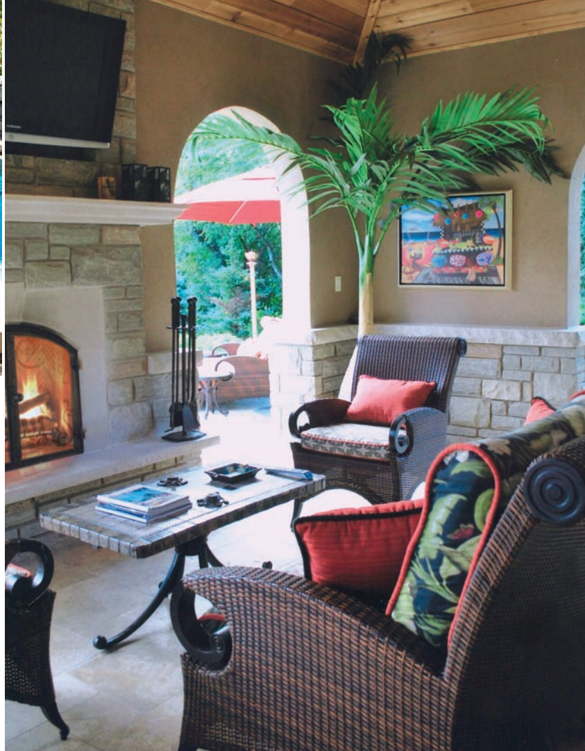
Bringing the indoors outside, Marina specializes at creating soft and comfortably chic spaces for you to enjoy.